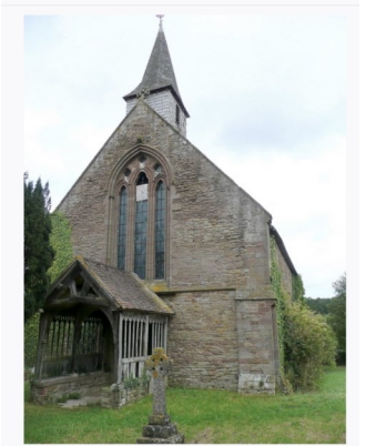
St John the Baptist's church